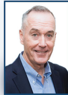
Semper Fidelis Joe Dunford