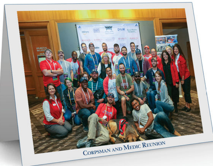
CORPSMAN AND MEDIC REUNION